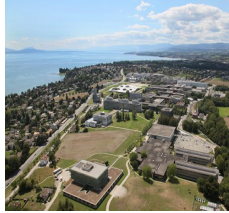
Venue Update University of Lausanne