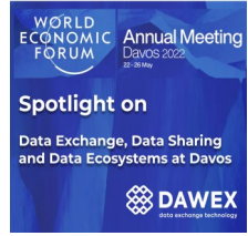
Gold Sponsor Update - Dawex